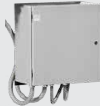
NEMA4 control panel